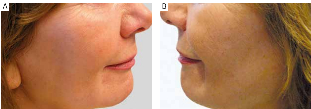
Figure 2. After volumetry treatment